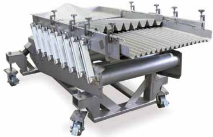
The Ultra Aligner improves spreading and aligning of raw poultry products optimizing the performance of further processes. The unit features removable aligning and spreading panels.

3/F Taiseido Bldg | 2-4-7 Hongo Bunkyo-ku | Tokyo 113-0033 | JAPAN +81 3 5842 3031 | +81 3 5842 3032 fax info.asia@ppmtech.com