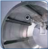
Spreader units can be added to distributor tube.

AC motors PLC Feedback sensors 4/20 milliamp input