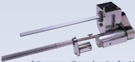
Entire seasoner with spreader option. Bar at top supports unit in drums or over conveyors.